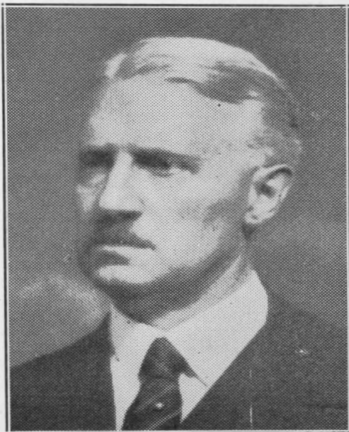
BAINBRIDGE COLBY, Honorary Graduate Proposes Lovejoy Centennial