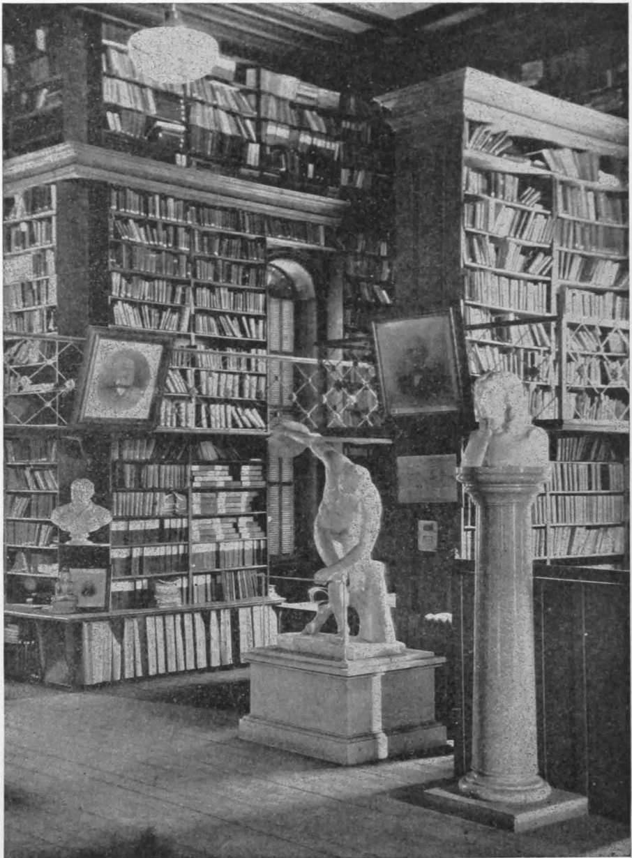
A CORNER OF THE OLD LIBRARY Showing Akers' Bust of Milton