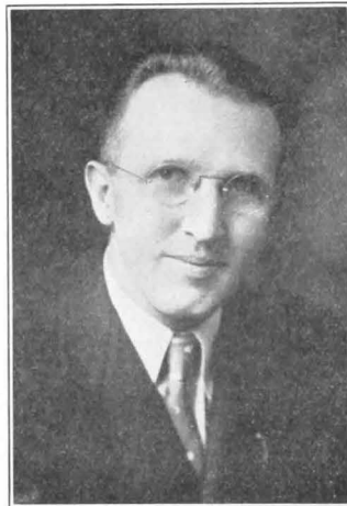
DR. H. MARSTON MORSE. '14

The particular part of the new mathematical technique developed by Dr. Morse, for example, might be used eventually to determine and guard against the factors responsible for economic upheavals. It now is entirely a case of hunting in the dark, with thousands of factors probably involved, the significance of which