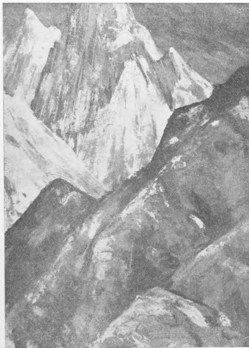
TOP OF THE WORLD