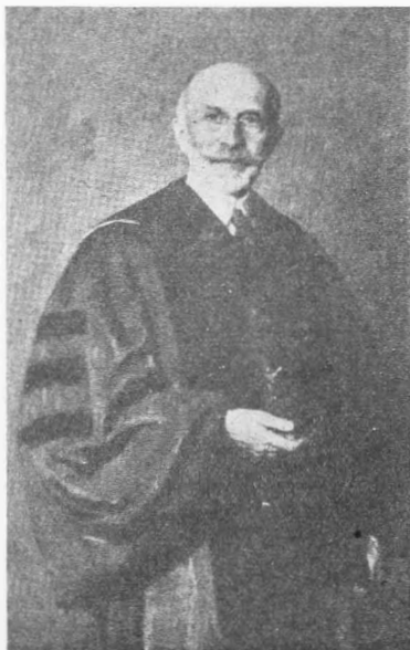
DR. ALBION W. SMALL, '76