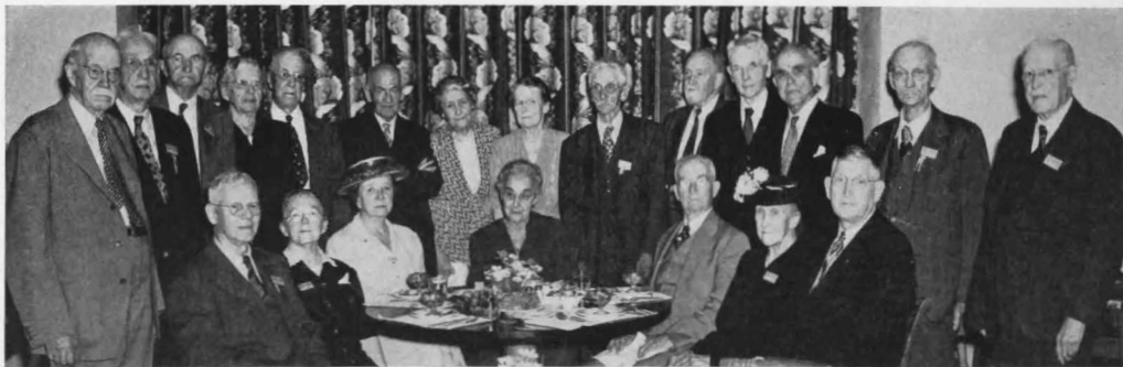
The Old Timers, 21 strong, meeting to discuss the graduations of 68 to 51 years ago.