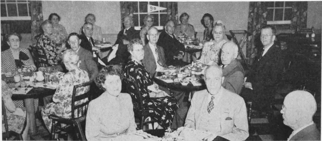
The 50 year class had a wonderful time and planned its 100th reunion. (See below.)