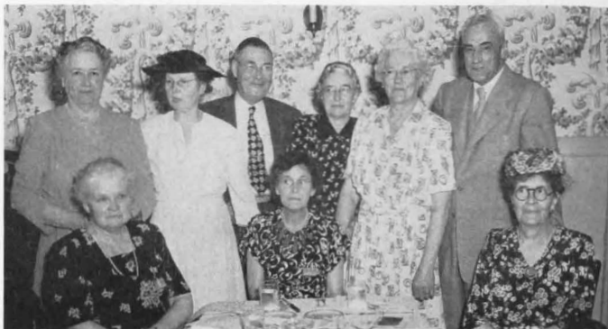
Noughty-Niners at the Elmwood Hotel.