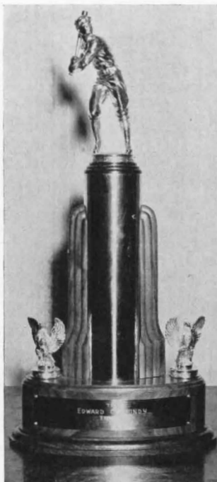
EDWARD C. ROUNDY TROPHY