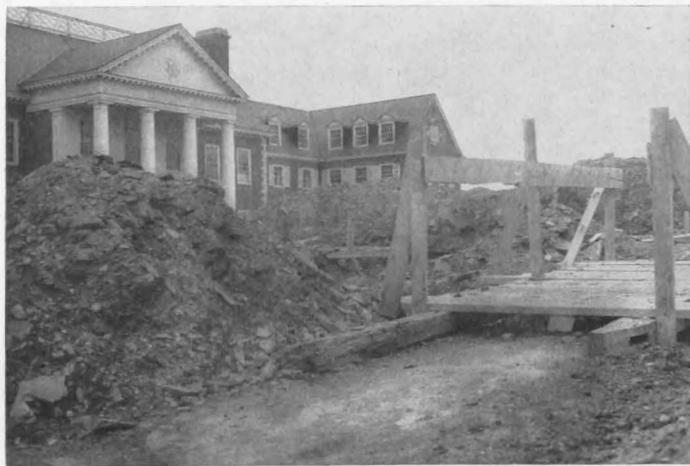
Piles of earth and coincident ditches and mud between Roberts Union and the Alpha Tau Omega house presenting a hazard for students throughout the year are expected to be filled in by Commencement. The mess was made necessary in order to install underground steam lines from the Union to the ATO and DKE houses.