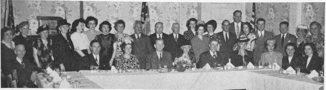
Knox County Alumni get-together at Rockland late in April to open Development Fund activity in that area.