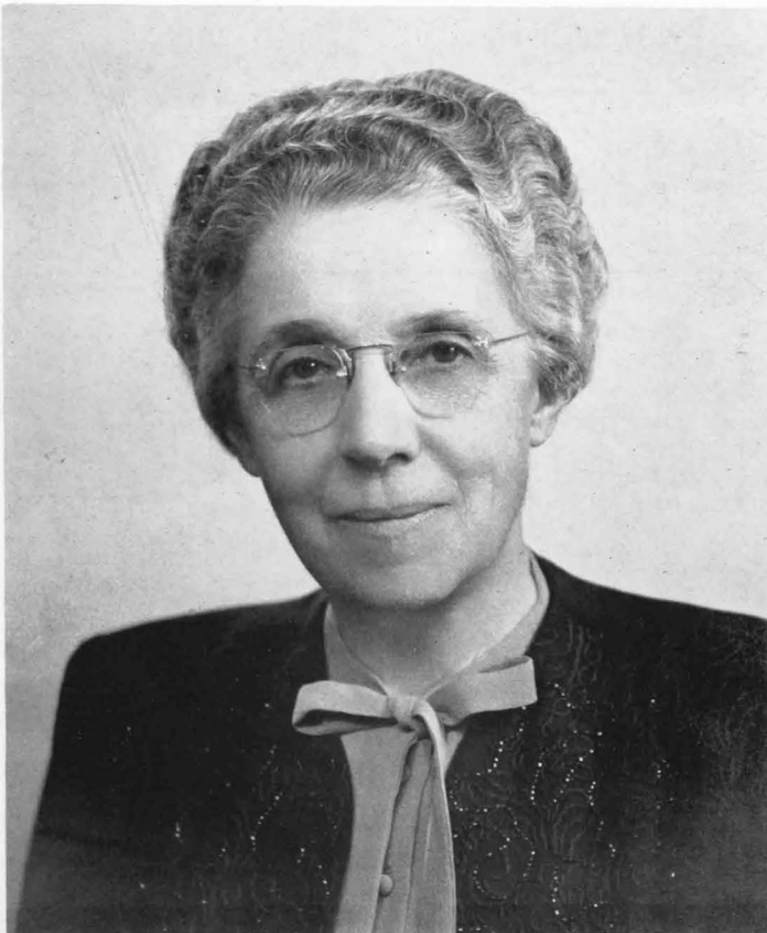
HER WORK NEARS COMPLETION