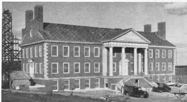
Portrait of the Keyes building from the steps of Miller Library. Work to complete the interior of the structure is expected to be renewed this spring or summer.