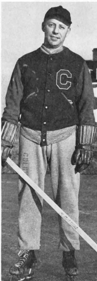
Back in togs . . .