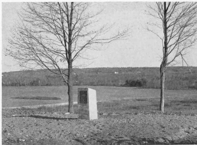
Elijah Parish Lovejoy's birthplace in Albion, Maine, is now marked by this cement column and tablet.