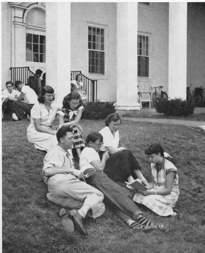
SHARING COLBY'S FACILITIES