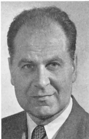
"HIS SHOES ARE GIGANTIC"

THE ALUMNUS, of course, felt the touch of his artistic hand and became a recognized leader among con-