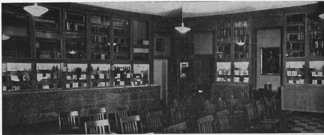
THE EDWIN ARLINGTON ROBINSON MEMORIAL TREASURE ROOM

In the rarified strata of Great Literature, Abbott will never find a place, but if one could measure the influence of a stream of informative, entertaining, and highly moral books which monopolized the reading diet of several generations of boys and girls, this Maine author might well be judged to have been an important force in America's formative years. It is high time that somebody got around to putting him in a Treasure Room.