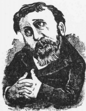
ISAAC KALLOCH, '52 (From a contemporary cartoon)

From this sketch one would deduce that here was a Baptist divine of more than average ability, who not only held prominent city pastorates, but who also entered the political arena as Mayor of San Francisco. One would scarcely guess at the juicy details unearthed by Mr. Marberry's research. For that re-