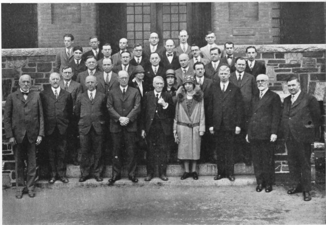
THE COLBY FACULTY ON APRIL 24, 1929