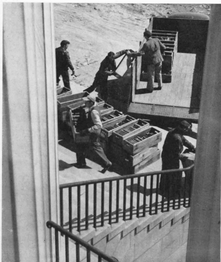
BOOKS ON THE MOVE