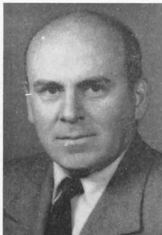
JOHN J. McCLOY