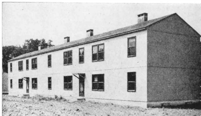
TYPE OF TEMPORARY HOUSING TO BE ERECTED ON MAYFLOWER HILL

A PARTMENTS for 32 married veterans will be provided by a temporary housing project on Mayflower Hill, according to arrangements completed between the college and the Federal Public Housing Authority. The location chosen is the area across the road from the rear of the Roberts Union which was designated on some of the earlier Mayflower Hill plans for faculty houses or apartments. This site is fairly close to water and sewer outlets and, at the same time, somewhat apart from the college buildings themselves.