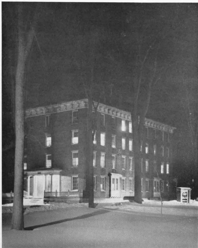
THE LIGHTS ARE ON AGAIN