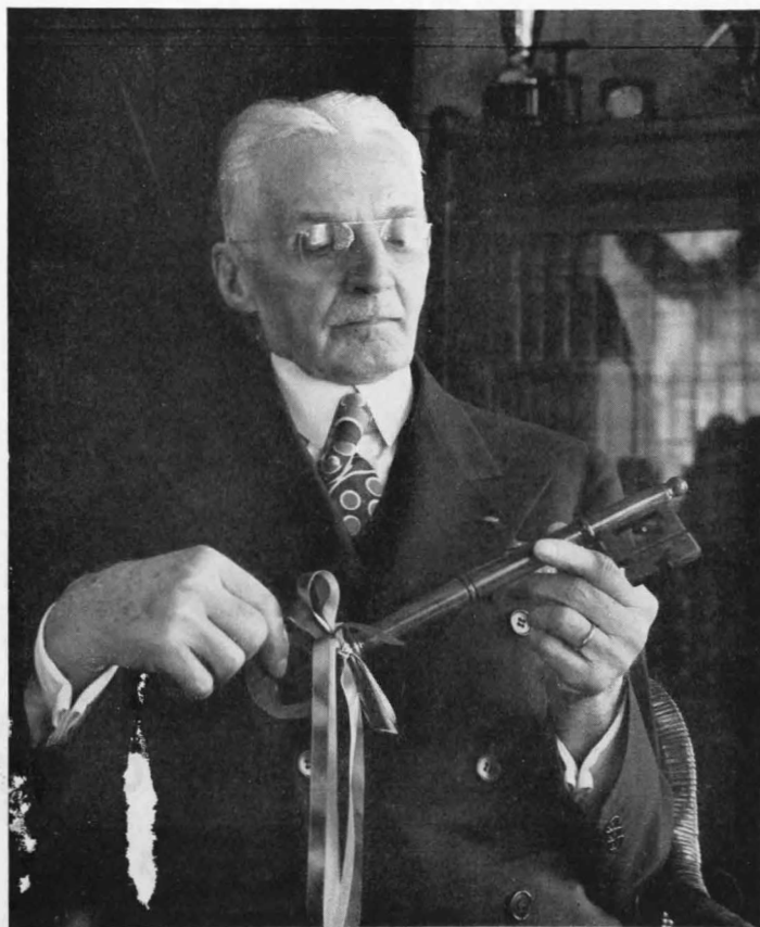
KEY TO THE HILL