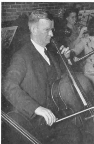
THE FIRST 'CELLIST

Well, we will gladly watch those kids in the future building up their own kind of golden memories—but as for us, we are content with our own set of memories, and doubtless no one can persuade the undergraduates of today that, war or no war, there ever was a better gang or a more exciting time to go to college than 1944.