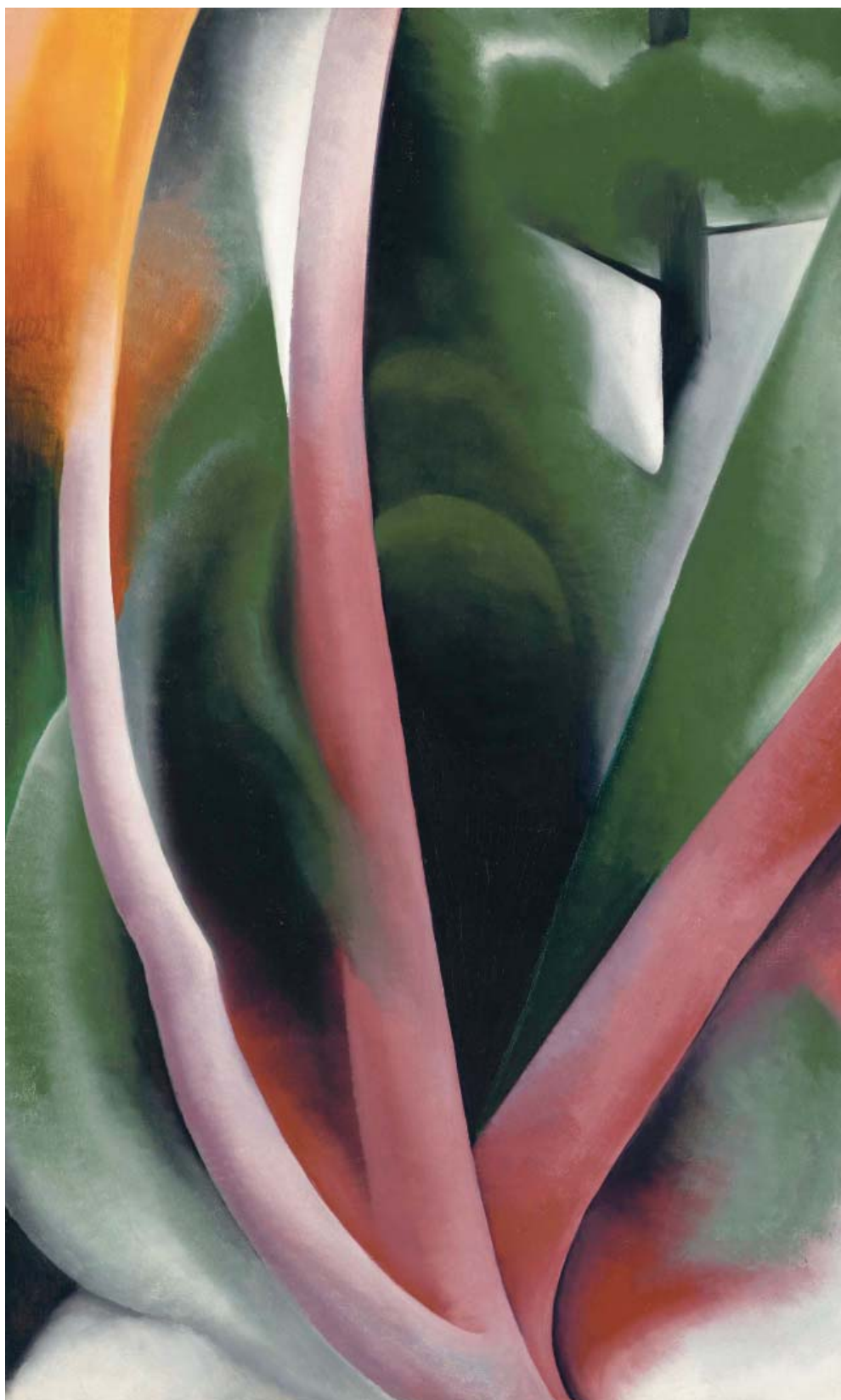
Birch and Pine Trees—Pink , Georgia O’Keeffe, 1925, oil on canvas, 36" x 22" Colby College Museum of Art, The Lunder Collection