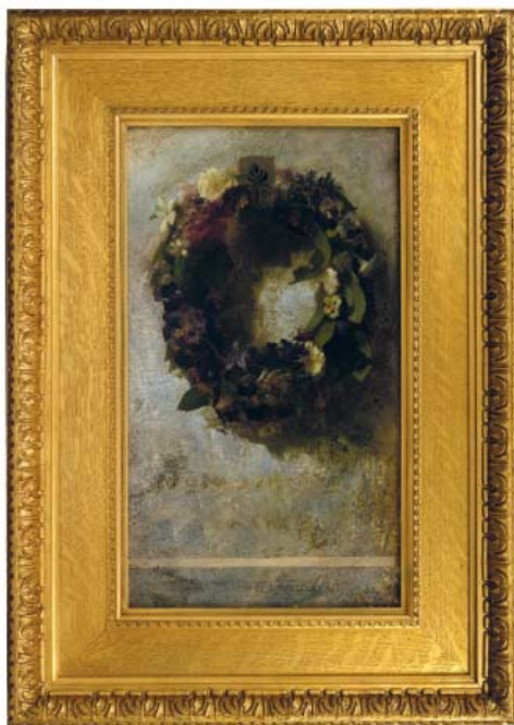
Agathon to Erosanthe (Votive Wreath) , John La Farge, 1861, oil on canvas, 23" x 13" Colby College Museum of Art, The Lunder Collection

“We talk incessantly, constantly. Early on in this process, they said very clearly that they wanted the Colby College Museum of Art to be to Maine what the Sterling and