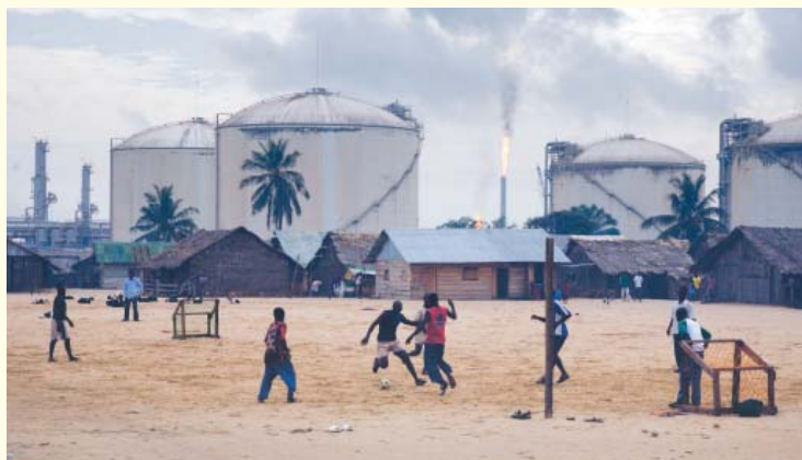
Nigerian men play soccer in a village adjacent to an Exxon Mobil gas plant. Oil development has produced jobs, but not for average Nigerians.

Apart from economic ties, there are obvious humanitarian concerns. Ironically, American citizens have more influence on Nigeria's fate than most Nigerians. U.S. governmental ties in Nigeria allow us to demand better for the Nigerian people. Encouraging the U.S. government to seek alternative energy sources and to depend less on foreign fuel could help create more affordable access to fuel for the average Nigerian, likely reducing violence. Further, insisting that all multinational companies working in Nigeria follow a strict code of conduct will assist Nigerians in reducing human rights violations, negative environmental impacts, and widespread corruption. As Hauwa Ibrahim, a Nigerian human rights attorney, once said: "It is our obligation to provide a voice to the voiceless and power to the powerless." Ultimately, it is the prosperity of the Nigerian people that will dictate the stability of this new democracy.