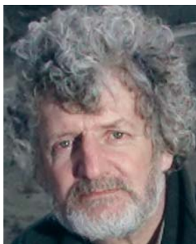
John F. Burns

The premier war correspondent of his generation, John F. Burns, who spent the last five years reporting from Iraq, will receive the Elijah Parish Lovejoy Award and give the annual Lovejoy Convocation address on September 30.