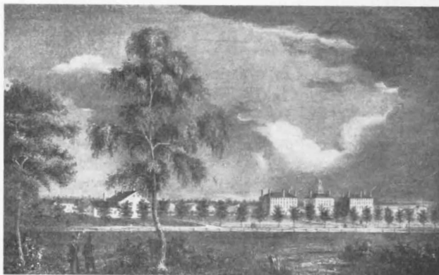
N.W. VIEW OF WATERVILLE COLLEGE, ON THE WEST BANK OF THE KENNEBEC RIVER, WATERVILLE, MAINE.