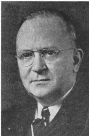
The Peripatetic Council Chairman