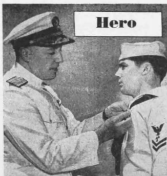
(See Column 1)

Colby's four striper (roughly equivalent to a Colonel in the Army) is a native of Danbury, N. H., and came to Colby from Tilton School. Following graduation, he took a year at Boston University Law School, but with America's entrance into World War I he joined up with the Navy as an Ensign. He has never left the service.