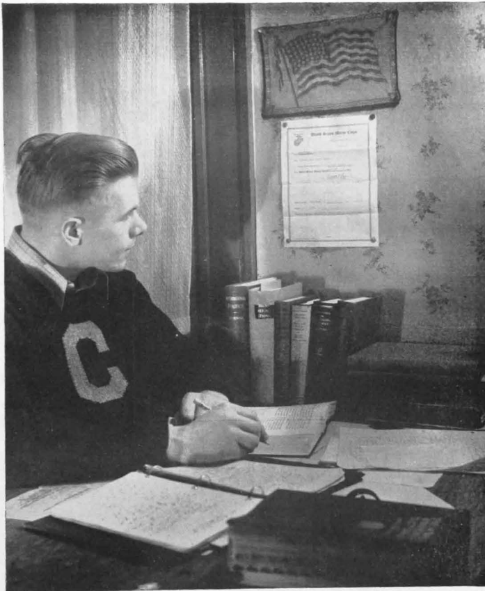
MARINE ON DUTY