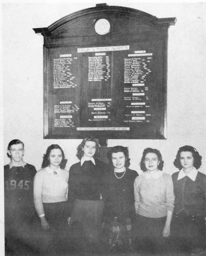
LINKS WITH THE FAR EAST