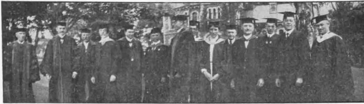
A Faculty Group About 1919. How many can you name?

hoplites in learning, masters of the teaching art and inspiring, attractive gentlemen; but I, a green country boy from the Belgrade farm home, didn't at that time know any better than to choose a classical education, and I don't know any better today.