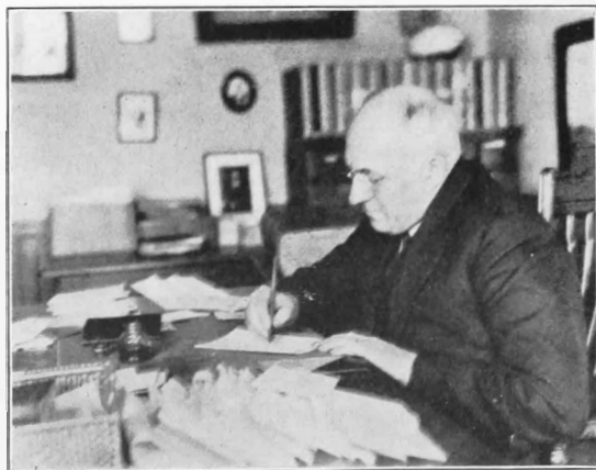
"Young men, be kind and keep clean!"

Lasell Junior College, Auburndale, Mass.