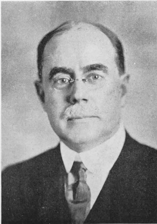
DEAN SHAILER MATHEWS, '84

For better or worse, American religious thought for a generation has laid strong emphasis upon this social aspect of Christianity, and Shailer Mathews was one of those who were most influential in teaching it to do so. It would be impossible, however, for any informed person to see in the social gospel, as he conceived it, mere humanitarianism or a sentimental sympathy borrowing the trappings of religion to lend spurious sanctity