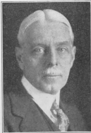
One of the "Boys"

Christmas Eve, when the festival was held at the Church, with the Christmas Tree for the delight of the Sunday School. There was a "gift" on the tree for every scholar, and no jealousy was possible, as it was identical in every case, consisting of a starched network replica of an abbreviated stocking filled with such delectables as pop-corn and "broken candy." Santa Claus, though a bit pagan for the Puritan sanctities, was impersonated, even as now, by some conscripted, accommodating youth who, though easily suspected from his voice and manner, was given all the illusion he deserved in his courageous efforts to create amusement by his capers and repartee.