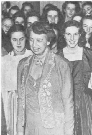
The First Lady at Foss Hall

Everything went smoothly until just before we hit Waterville, where we crossed a small bridge and looked for a police escort which we were told would be on hand to meet us. We saw none, but a car stopped