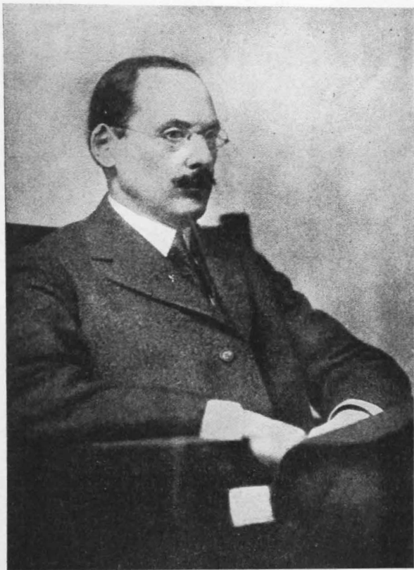
EDWIN ARLINGTON ROBINSON