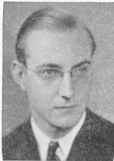
ALFRED W. BEERBAUM Teaching Fellowship in German University of North Carolina