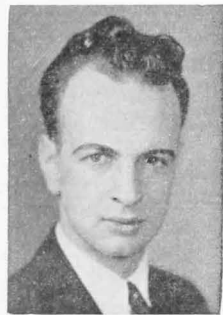
FREDERICK B. OLESON Teaching Fellowship in Physics University of Maine