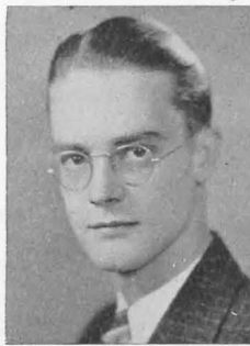
CARLETON N. SAVAGE Teaching Fellowship in Geology Northwestern University