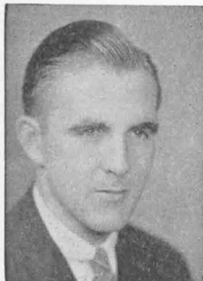
ROBERT N. ANTHONY Service Scholarship Harvard Business School