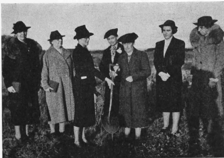
AS COLBY WOMEN BROKE GROUND FOR UNION

This ceremony, while symbolic, proved somewhat ineffective as to making a hole in the ground. This was remedied, however, by the steam shovel which immediately blew off steam, snorted, and began to chew into the ground in earnest, putting on a good show for the audience and proving that dirt was actually beginning to fly.