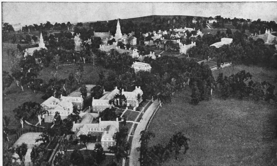
BIRD'S EYE VIEW OF THE FUTURE COLBY

A realistic idea of what the future airplane traveler will see as he passes over Colby is given by this view of the Model. The road entering from the bottom will serve as the chief approach from the City. In the foreground are the women's dormitories and social union. The spire of the Lorimer Chapel appears in the upper left, while the larger tower nearer the middle surmounts the library. Near the upper right hand edge is the roof of the field house and one chimney of the men's gymnasium.