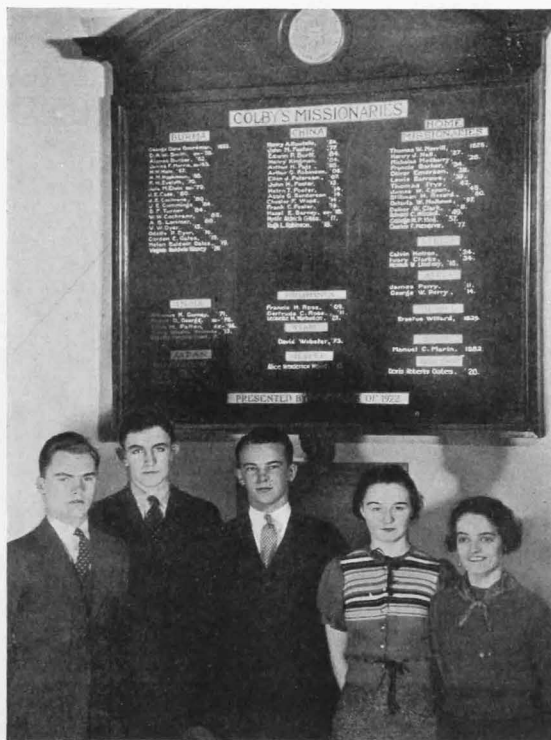
THE COLBY MISSIONARY TRADITION

for Christ" which is to begin in August. There is a marvelous openness to the Gospel message among students and refugees and all classes of people. On June 12 we had the joy of seeing twenty-seven (mostly, if not all, students) baptized into membership in the North Shanghai church and the college church, which now worship together at the Y. M. C. A., and the Sunday before one of our boys was immersed at the Community Church. So the Holy Spirit is working in the hearts of the Chinese people during this time of sorrow. Pray for us that we may do our part in this work and that we may have faith as we face the unknown future. God will work out His plan eventually in spite of the evil designs of men.