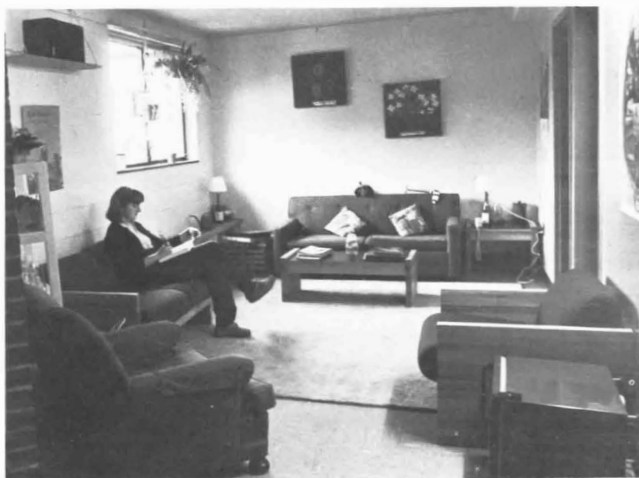
Four-person suites include a central living area which enhances the sense of community at the dormitory.

"It has already become what we all hoped it would become: a major intersection for the social and intellectual interests of this College. It is a building of magnificent possibilities. And its impact is already being felt, not only by its residents, but by all of us who live or work at Colby."