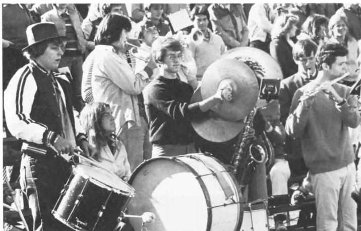
The Colby Pep Band lent a hand at the Homecoming football game. Although they cheered the spectators, there was little they could do to help the action on the field. Colby lost to Trinity 24-0.