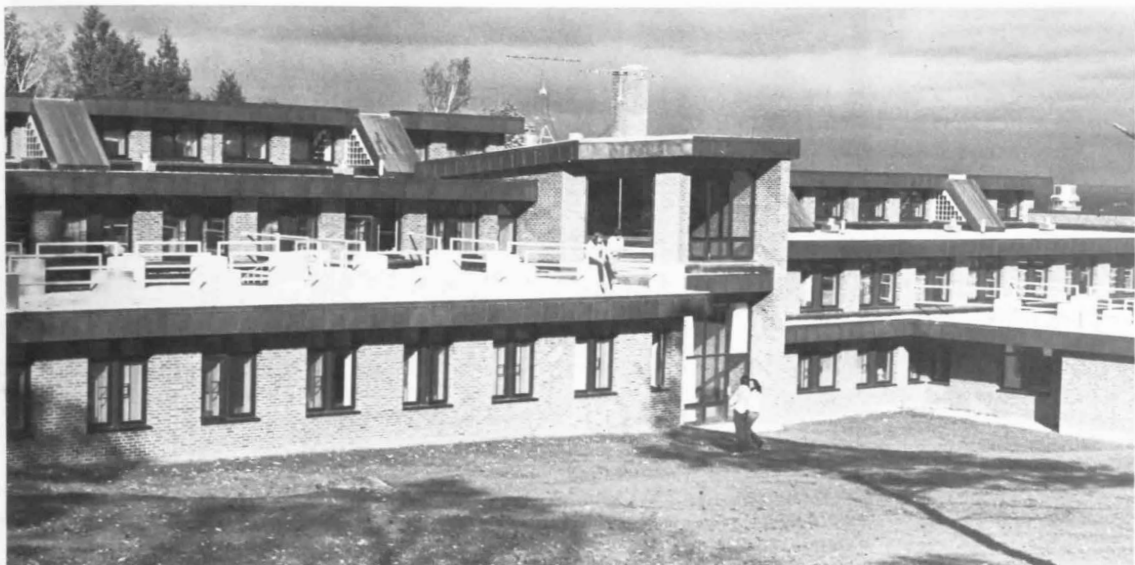
The south side of the dormitory utilizes a passive solar design allowing for a marked decrease in fuel consumption.