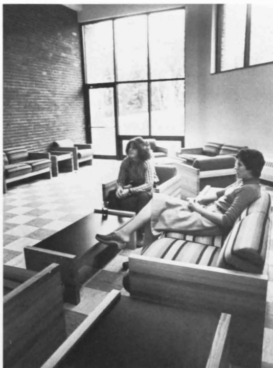
Students relaxing in one of the three lounges in the dormitory.