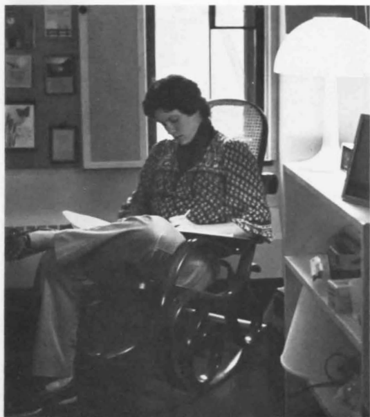
A relaxing atmosphere for study.