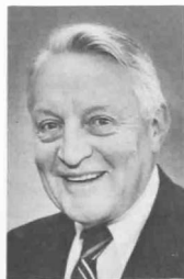
posts he held until joining Unionmutual.