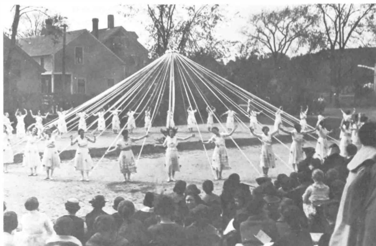
Ivy Day, 1922