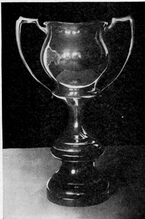
CLASS OF 1906 CUP

This plan is one which has already met with success in several other New England colleges, and the Colby