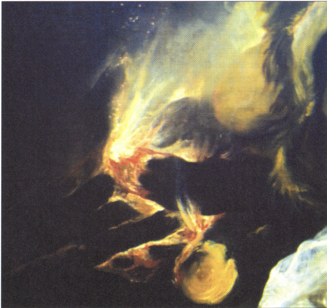
Plates 2 and 3 above; Plate 4 on facing page Luca Giordano, Hercules on the Funeral Pyre , detail, c. 1665–70. Oil on canvas, 44 \frac{3}{4} x 113 \frac{1}{2} inches. Colby College Museum of Art, Waterville, Maine. Museum purchase from the Jere Abbott Acquisitions Fund.