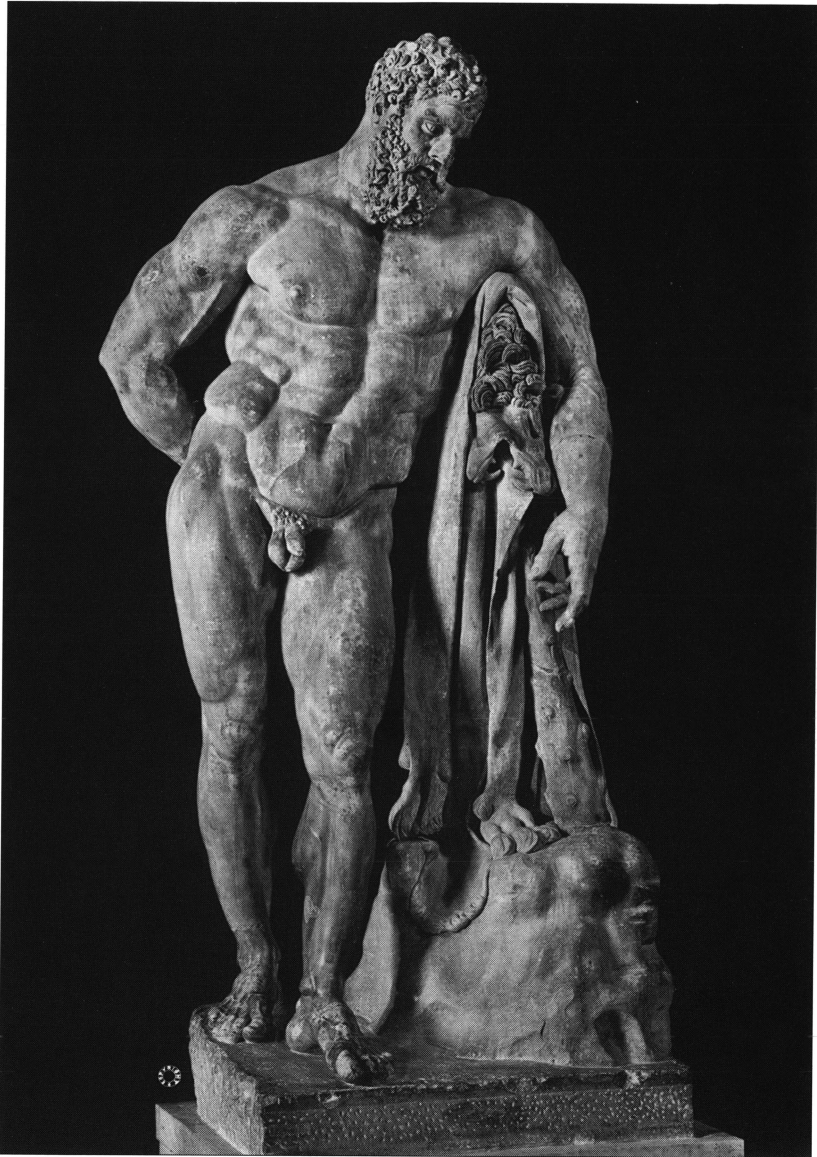
Plate 6 After Lysippos, Farnese Hercules (Roman marble copy of bronze original), c. 125 inches high. Museo Nazionale, Naples.