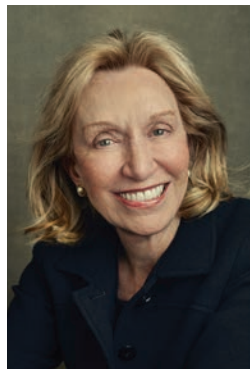
Doris Kearns Goodwin '64

Doris Kearns Goodwin '64 has been in the news discussing presidential leadership and what history can teach us. From an essay in Vanity Fair to a book review (her latest is Leadership in Turbulent Times ) in the Dallas News to interviews on WBUR and in the IndyStar , Goodwin warns, "There is a terrible danger in growing accustomed to the erosion of meaning in our political discourse. Serious, perhaps lasting, damage is being done to our identity as Americans and to our democracy."