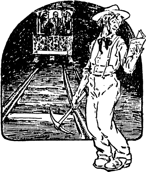
IN THE SUBWAY.

Monteiro: "The President and the Poet": Robinson, Roosevelt, and The Touchs magazine. On a few occasions he has even bucked the publishers himself. As a rule Teddy finds his time pretty well taken up with such practical matters as peace conferences, canals, and strikes. Matters of that sort he can polish off any morning before breakfast, but when it came to doing something with a poet, and a New York poet at that, he was stumped.