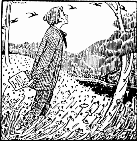
IN THE DAISY FIELDS OF MAINE.

(President Roosevelt has appointed Edward Arlington Robinson, the poet, to a position in the Custom House, and he has also written a review of Mr. Robinson's poems for the Outlook .—Newspaper Item.)