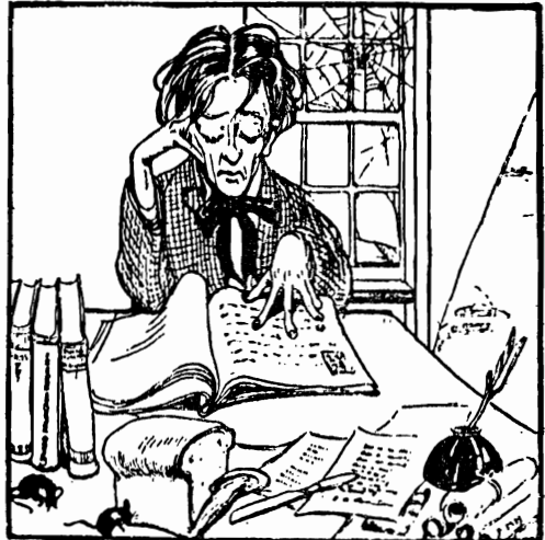
IN A NEW YORK ATTIC.