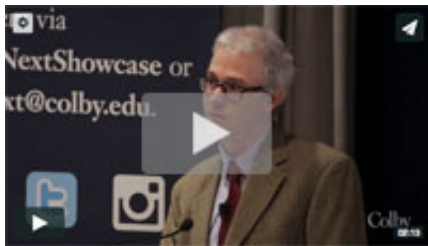
Video: Faculty Showcase