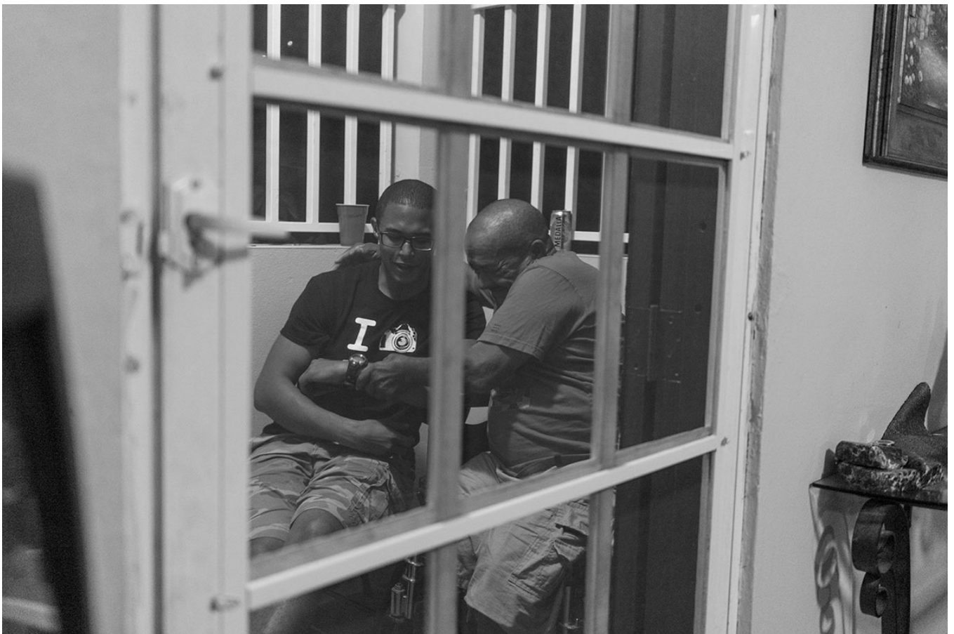
Consolation at my grandfather's home.