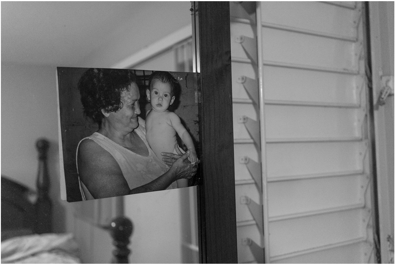
An image of my grandmother hangs in my grandfather's bedroom in Puerto Rico.