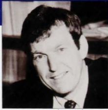
Cal Mackenzie Government