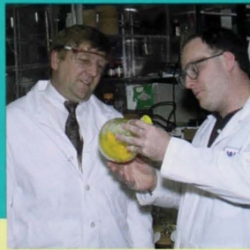
▲ 14 Bio-detective