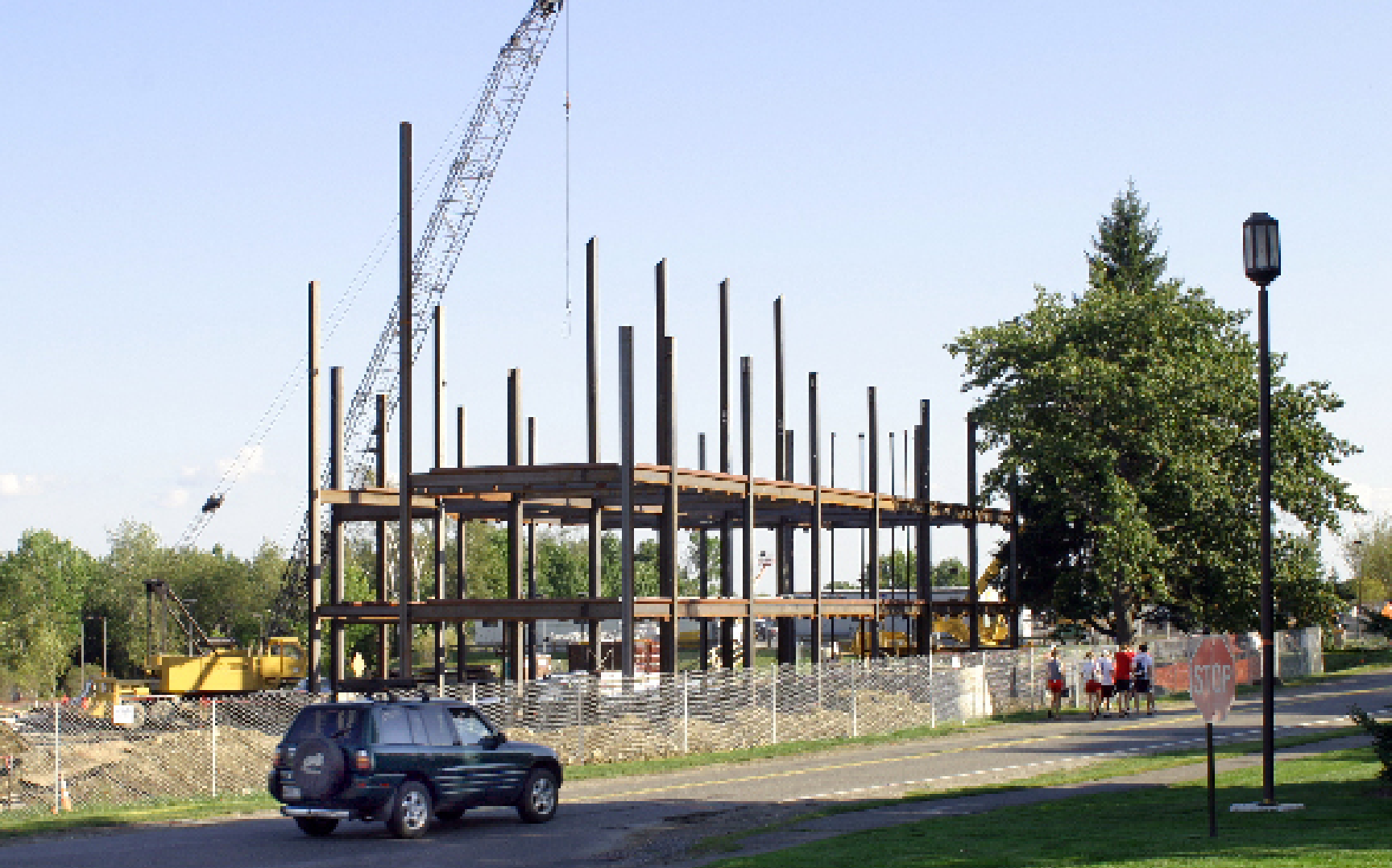
The framework of the new Diamond Building, a major academic initiative that will offer new opportunities in social sciences and interdisciplinary studies. The Diamond Building is part of a dramatic expansion of facilities included in the Strategic Plan for Colby, launched in 2002.

more elemental approach—one that gets to the root of these and other social problems by developing scientists and economists and leaders who can have a broad impact on a wide range of social challenges.