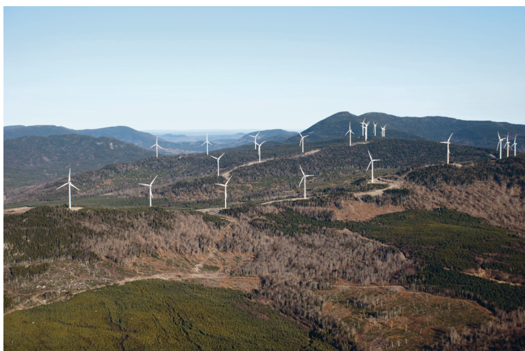
Wind turbines at the Kibby Mountain wind farm in northwest Maine.