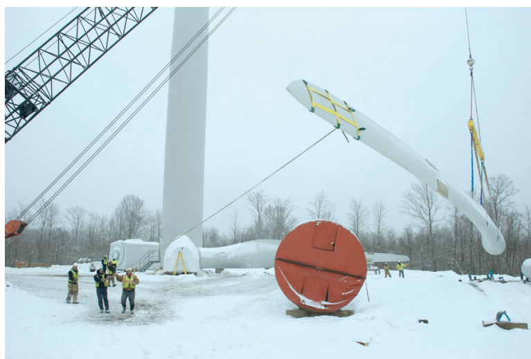
Workers for Reed & Reed maneuver a wind turbine blade into place at Stetson Mountain in Washington County, Maine.

Driven by climate-change and other concerns, the energy-industry transformation is unfolding quickly as wind power is seen as one of the most viable, albeit challenging, energy sources for the Northeast. In Maine, signs that wind power is the future are everywhere. Since the first industrial-scale turbine complex went on line at Mars Hill in Aroostook County in 2006, proposals and permits have