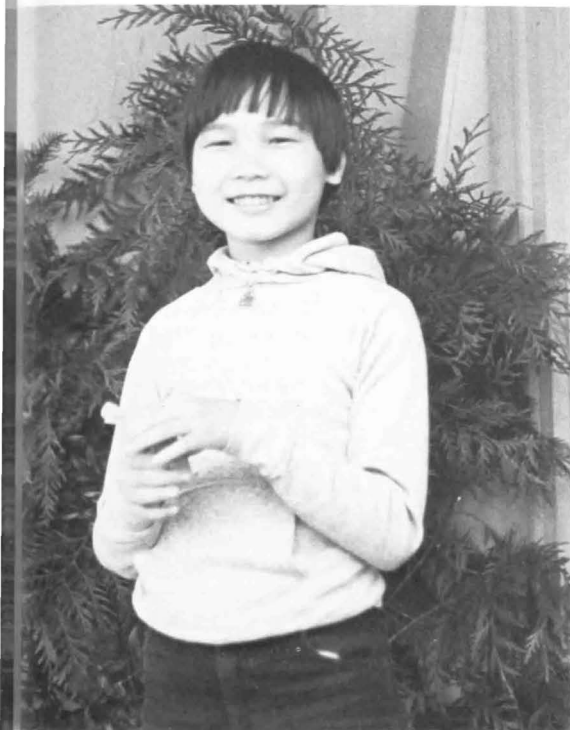
Yet another cultural distinction made it impossible for the Vietnamese children to be photographed candidly by the author; they immediately posed when they spotted the camera! In other respects, the youngster above appears to have adjusted happily to his new home.

ALL OF THESE CHILDREN, WHOSE NAMES HAVE BEEN changed to conceal identities, are "unaccompanied minors" whose entry into the United States was sponsored by the United States Catholic Conference. Over 100 of these youths have been in our program in Tacoma, Wash., one of several such programs in the country. By leaving most of their families behind and risking their lives, these young people have added almost incredible trauma to their already intense adolescent years.