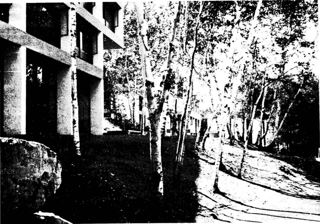
New residential complex