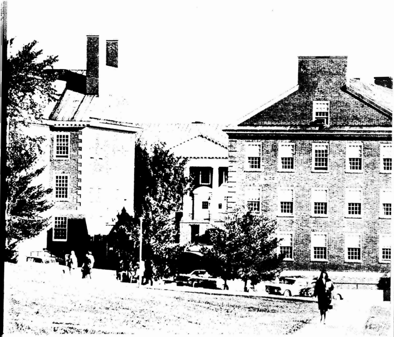
Lovejoy (left), Keyes (center), and Eustis buildings