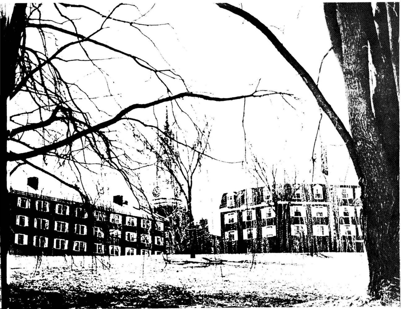
Johnson Pond Miller Library