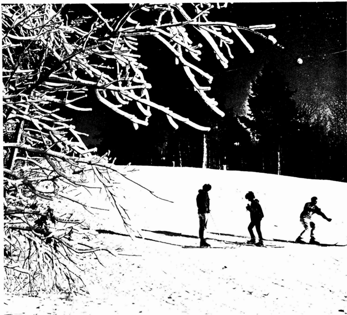
Afternoon in winter; the Colby College Ski Area.