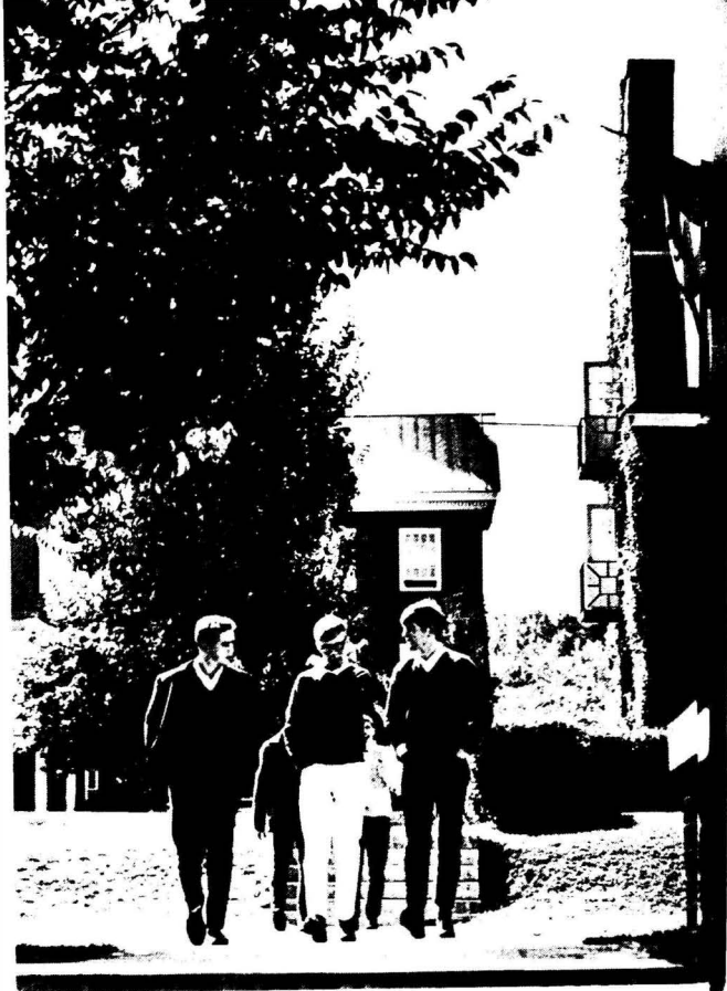
From Roberts Union