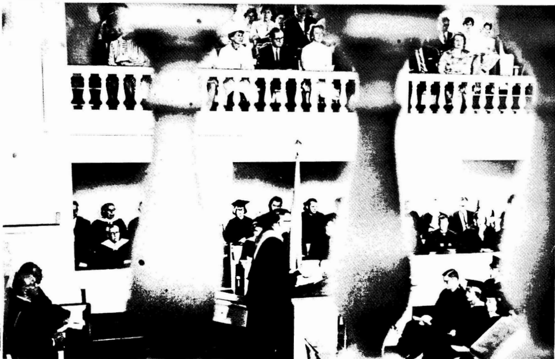
Interiors: (above) Lovimer Chapel, Baccalaureate Service; Jetté Gallery, Colby College Art Museum (Bixler Art and Music Center)