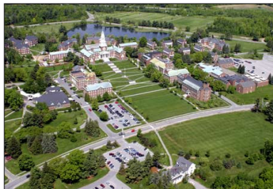
Colby Campus, 2005

Much of the Colby campus is currently covered by impervious surfaces, which greatly increase run-off. When rainwater lands on buildings or pavement, it can not be absorbed into the ground, and instead washes away into nearby bodies of water, carrying with it any pollutants present from motor oil or pesticides applied to the bordering grassy areas. My goal was to use GIS to determine the percent of campus covered by impervious surfaces, and also to show how much of this area has been added over the past 40 years.