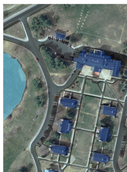
Semi-transparent polygon layer overlaying the ortho photo tile

I calculated the area of every polygon by surface type to obtain my final estimates of the area covered by impervious surfaces.