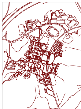
Original Polyline Layer

ArcGIS was used to create a map of all current impervious surfaces at Colby, which was then compared to an aerial photograph taken in 1965 to determine which buildings and paved areas had been added since then.