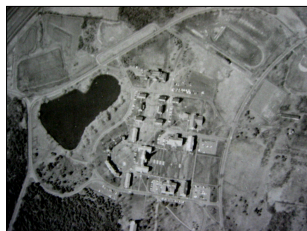
Colby Campus, 1965

I then compared the resulting product to an aerial photo taken in 1965, and re-labeled all buildings and pavement on my map that were not present in the photo. To do this I had to edit many of the old polygons to show where additions had been added to buildings or paths.