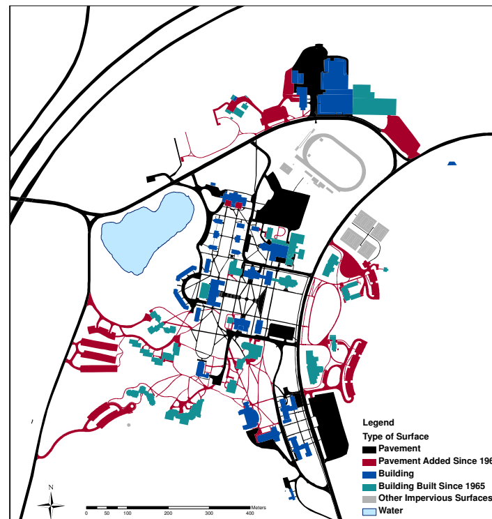
Map of Colby by Surface Cover

I calculated the area of every polygon by surface type to obtain my final estimates of the area covered by impervious surfaces.