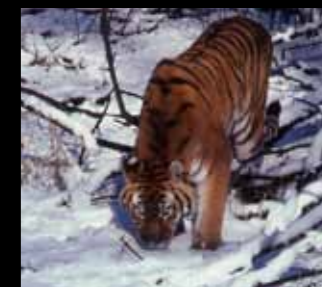
LEFT: PAINTING OF TIGER BY MARUYAMA OKYO; UPPER RIGHT: TIGER AND MAGPIE, KOREA; LOWER RIGHT