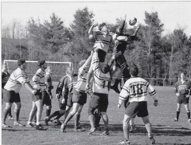
Colby, in white, goes head to head with Le Moyne in the New England playoffs.