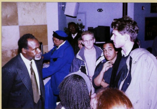
Danny Glover, the actor and social activist who delivered the keynote address at the CBB Diversity Conference, discussed issues with students afterward.