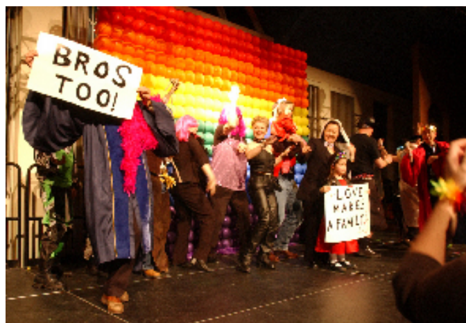
Top, students, staff and faculty gather at a rally in Cotter Union last spring called after computer equipment was vandalized in the offices of minority student clubs in the Pugh Center. Above, participants in the annual Pride Week drag show gather on stage in Cotter Union.

directed against queer students and organizations.