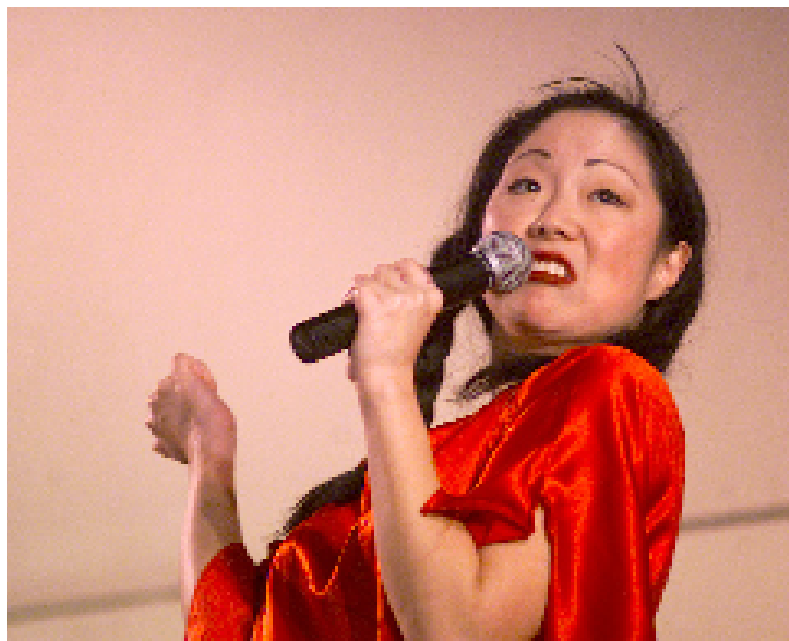
Comedian Margaret Cho performs before a full house at Wadsworth Gymnasium at Colby during Pride Week this year.