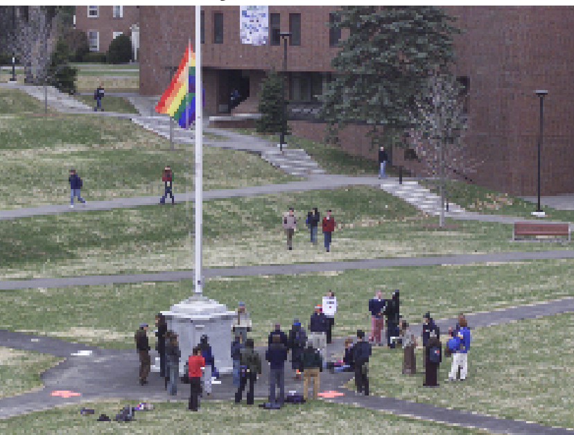
Students gather to raise the rainbow flag, a symbol of the diversity of gay, lesbian, bisexual and transgendered communities, in front of Miller Library in May 2002. Some on campus objected to the displacing of the American flag, even for two hours.