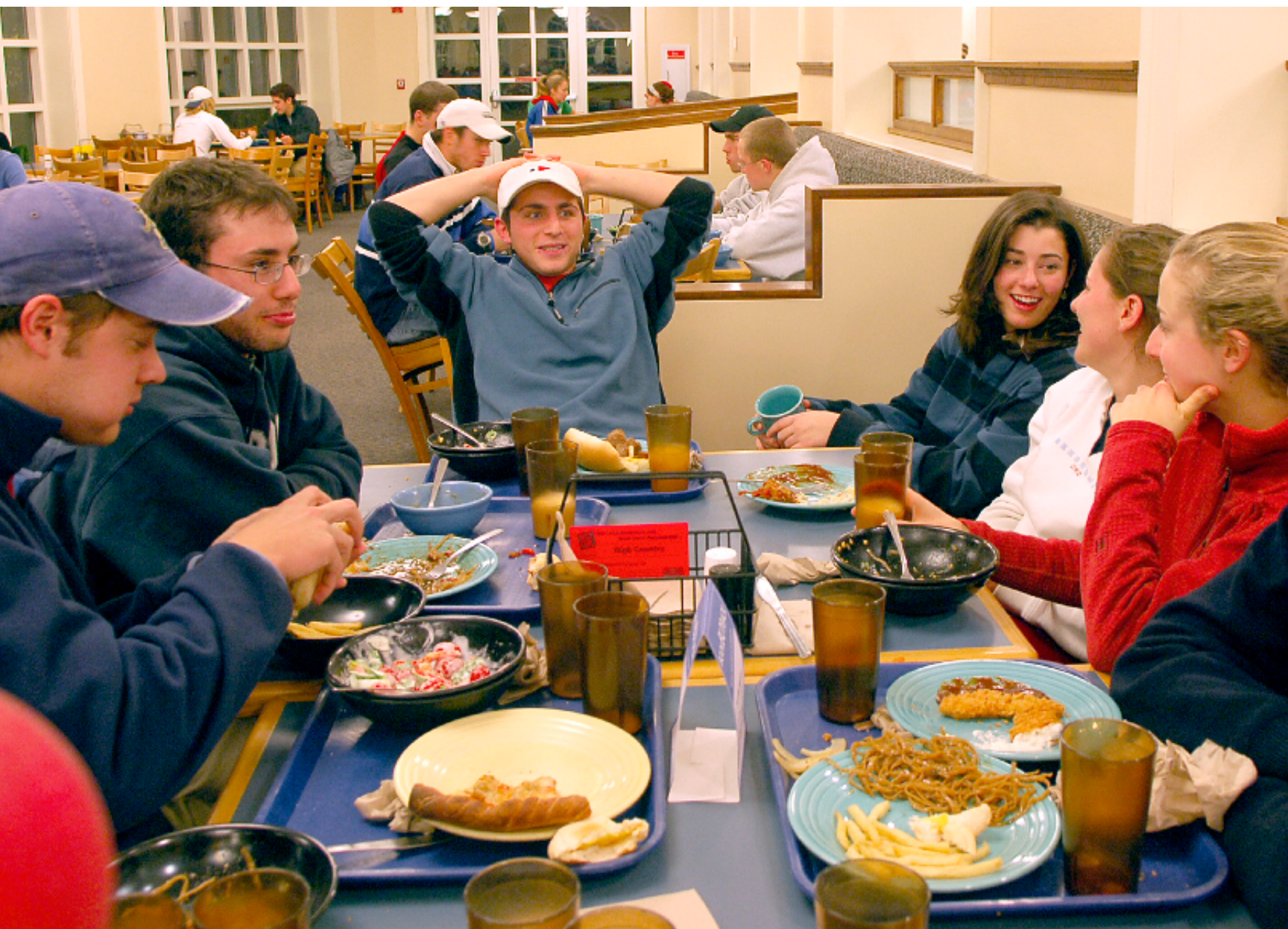
Students relax over dinner at Dana dining hall, where the menu and clientele may differ from that of other dining halls on campus.