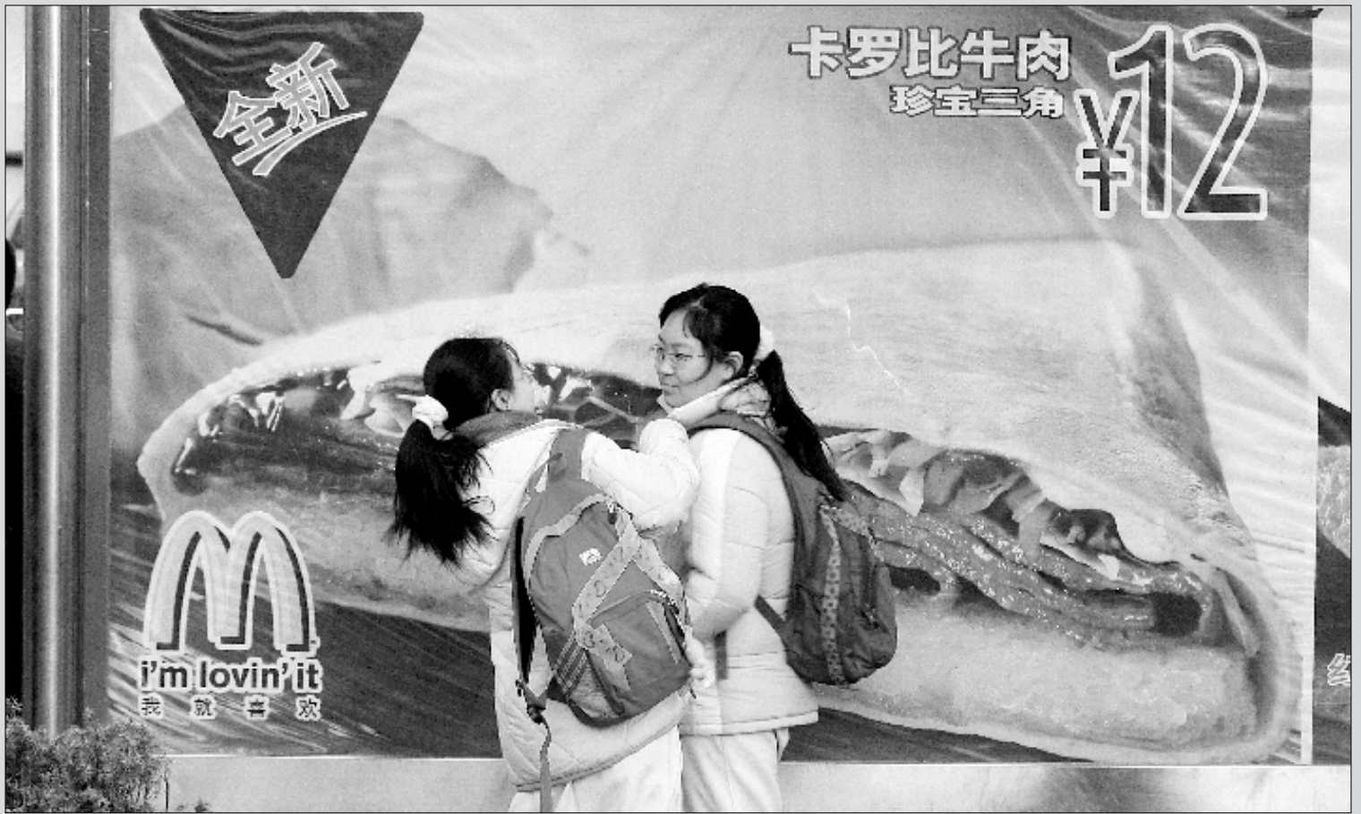
Beijing, China, 2005