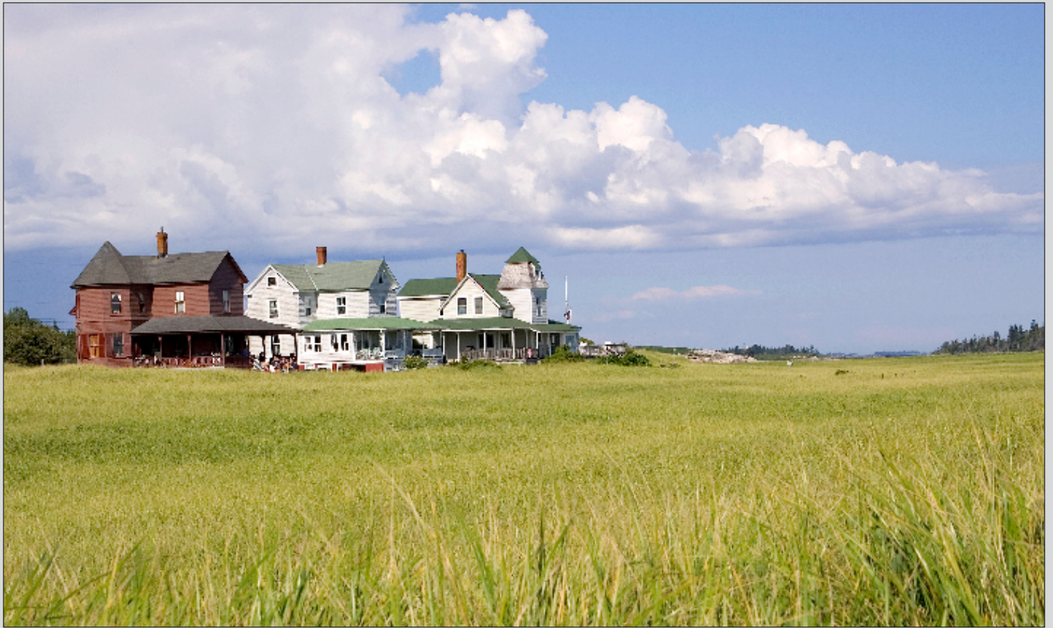
Phippsburg, Maine, 2004