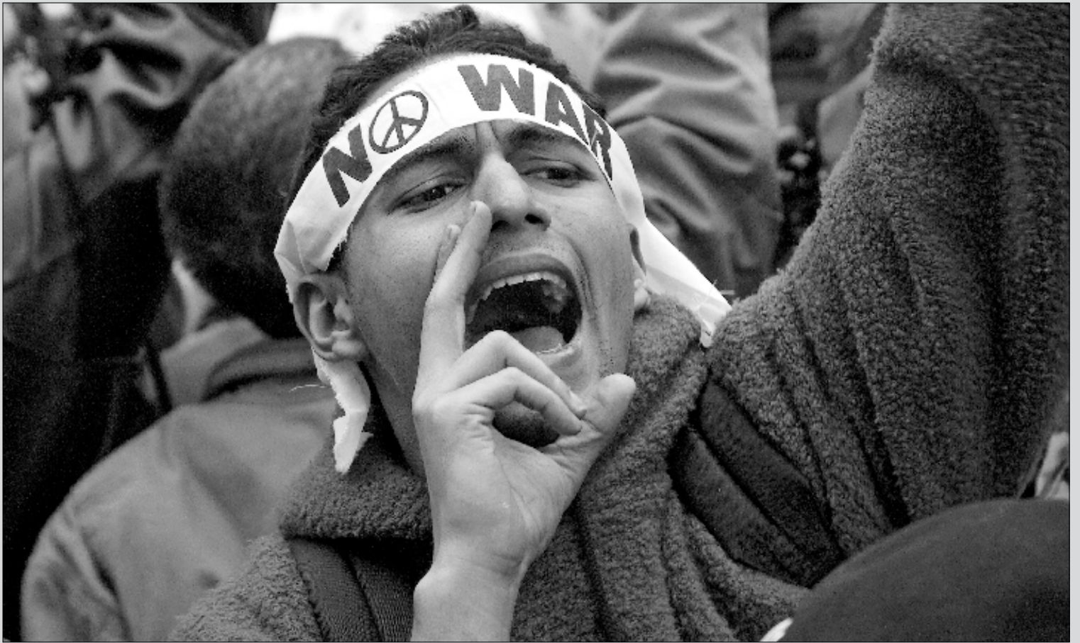
Iraq War demonstration, New York City, 2003