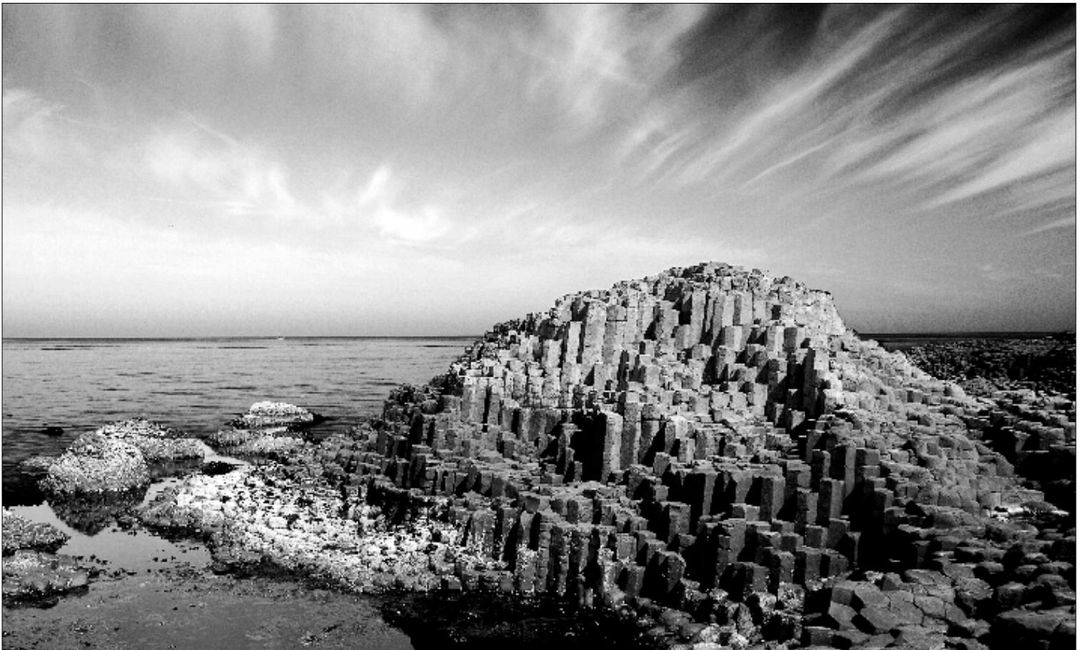
Giant's Causeway, County Antrim, Northern Ireland, 2006