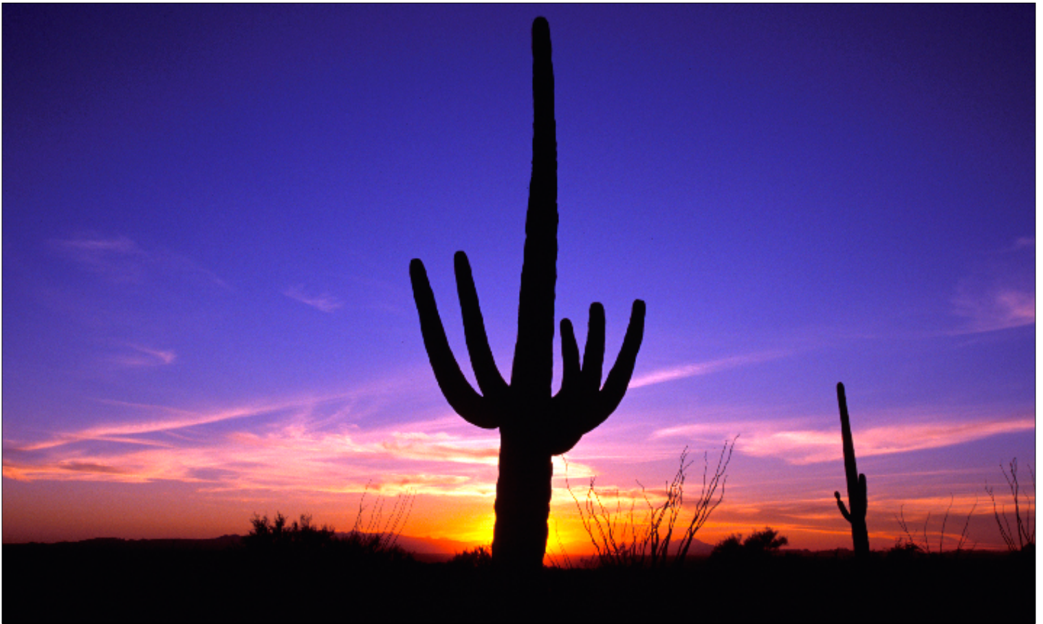
Sonoran Desert, Arizona, 2003