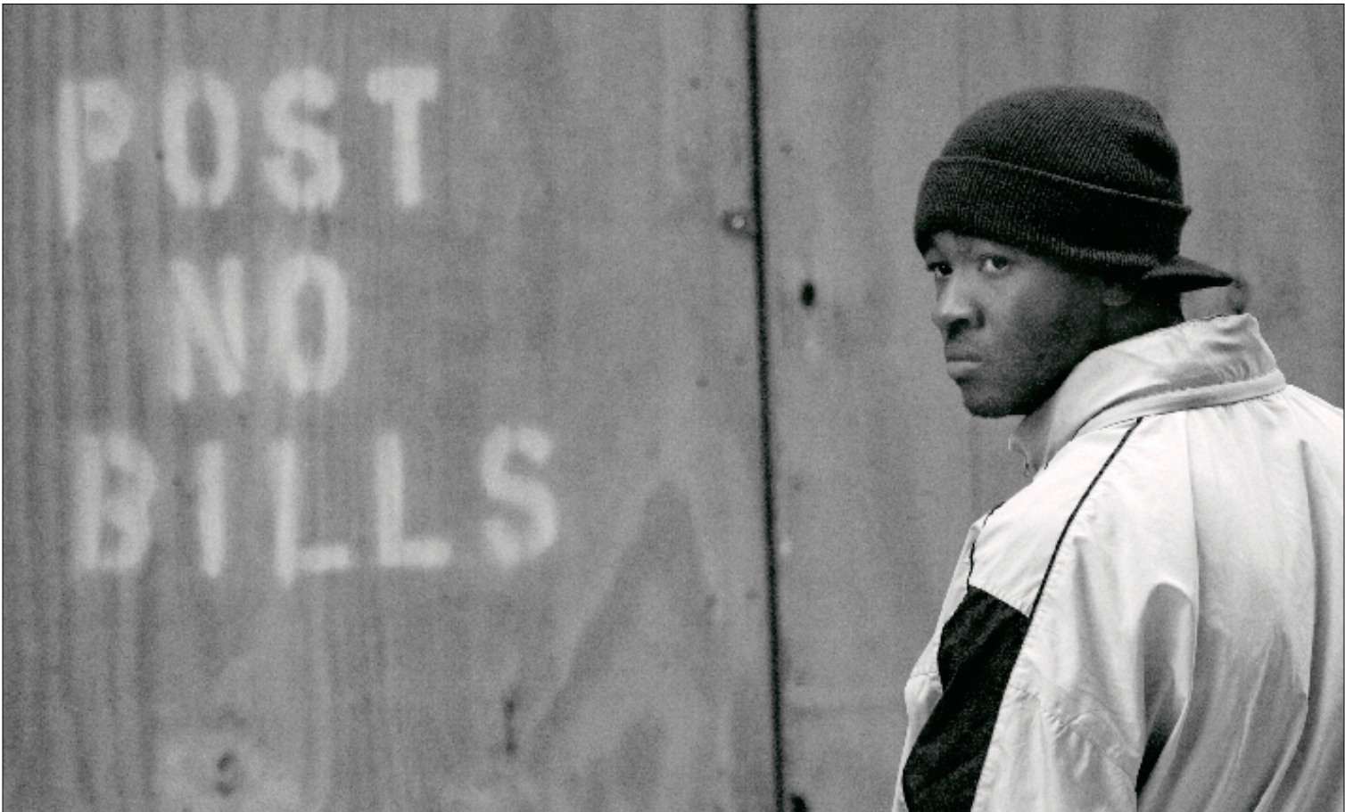
New York City, 2006