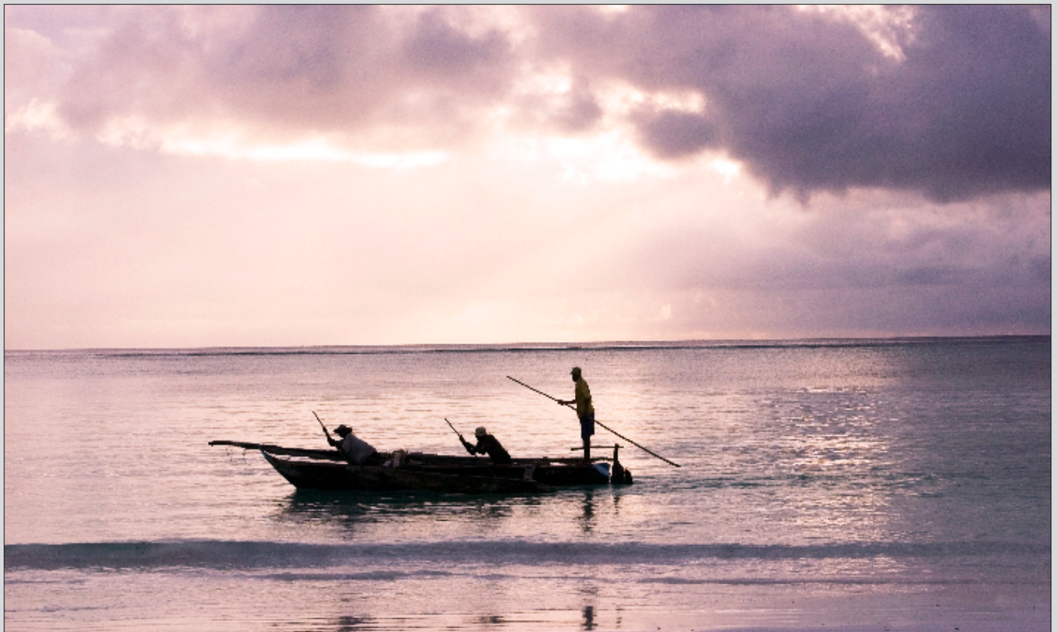
Zanzibar, Tanzania, 2004