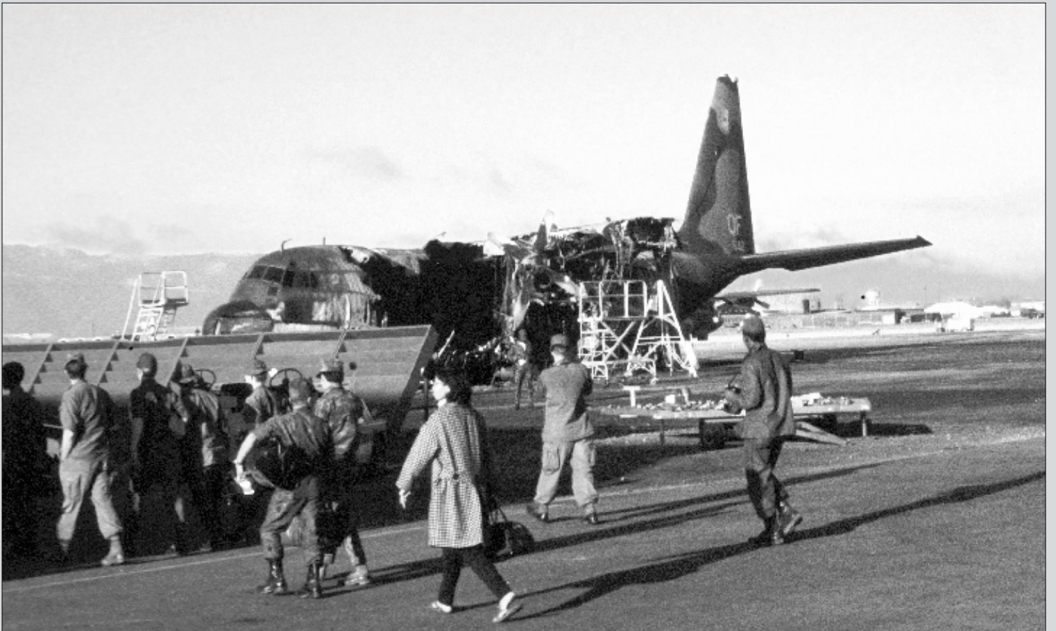
Bombed transport plane, Danang, Vietnam, 1971