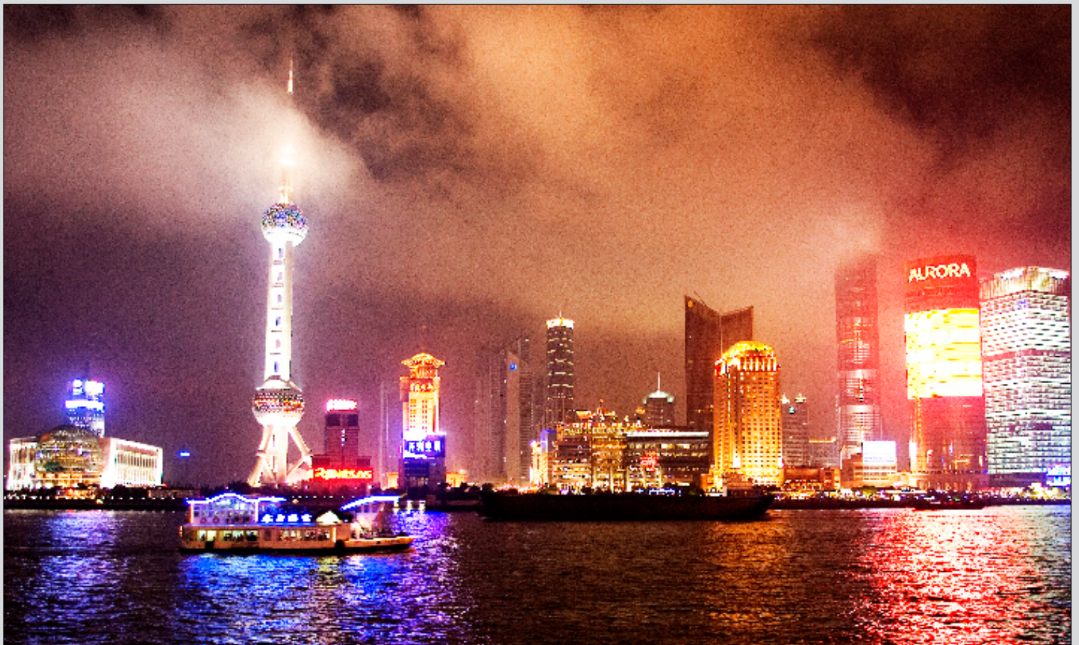
Shanghai, China, 2005