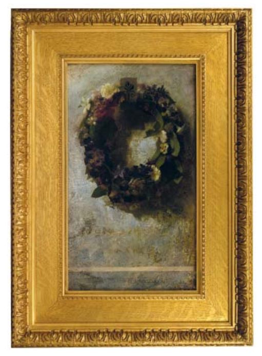
Agathon to Erosanthe (Votive Wreath), John La Farge, 1861, oil on canvas, 23" x 13" Colby College Museum of Art, The Lunder Collection

"We talk incessantly, constantly. Early on in this process, they said very clearly that they wanted the Colby College Museum of Art to be to Maine what the Sterling and