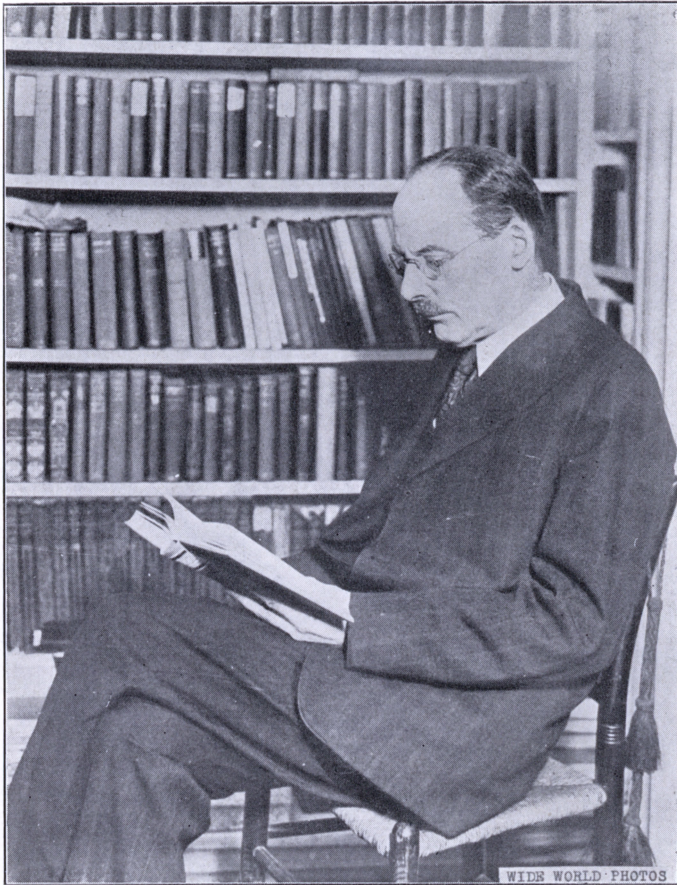
EDWIN ARLINGTON ROBINSON and his books