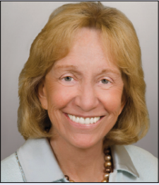
Doris Kearns Goodwin '64