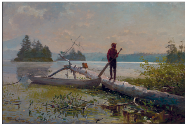
Winslow Homer, The Trapper , 1870, oil on canvas, 19 1 / 16 x 29 1 / 2 " Colby College Museum of Art, Gift of Mrs. Harold T. Pulsifer

titled Art at Colby , includes 144 brief essays detailing 176 pieces in the collection. The 98 essay contributors represent a variety of professions, including art historians, poets, curators, and others from a broad range of disciplines. The museum staff is also orga-