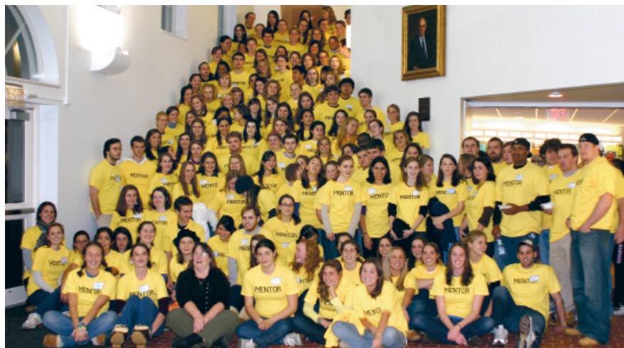
Mentors in Colby Cares About Kids (CCA) pose during orientation last fall.

The success prompted Maine's governor to direct a $500,000 federal grant to replicate the CCAK model at other campuses throughout the state: Bowdoin, University of New England, the University of Maine, and University of Maine campuses in Augusta, Portland, and Lewiston.