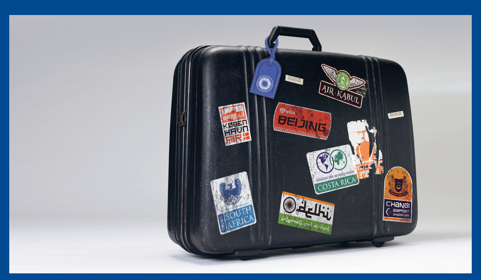
International Future? A decade-long relationship with the Davis United World College Scholars program has "internationalized" the student body at Colby. But what's next? P. 20

All Colby publications produced by the Office of Communications are printed on green-certified papers made from 100-percent post-consumer fiber and manufactured with alternative fuels.