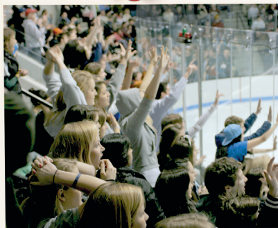
Cheering the Mule train