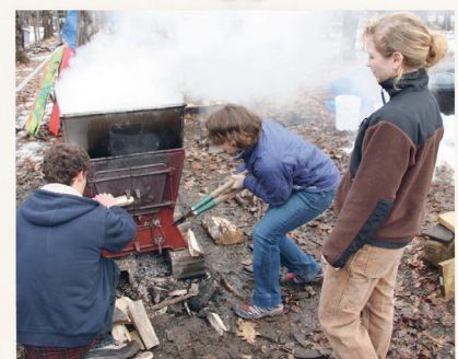
Cooking the maple sap